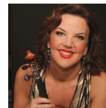
Tasmin Little 22 September 2012