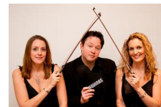
The Aquinas Piano Trio 17 November 2012