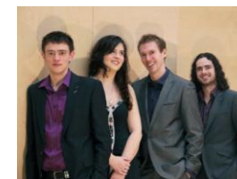
Absolution Saxophone Quartet 20 April 2013

6 Great Concerts for the price of 4 website: www.musicatduffield.com