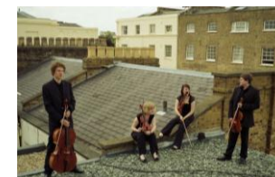
The Artesian String Quartet 9 February 2013